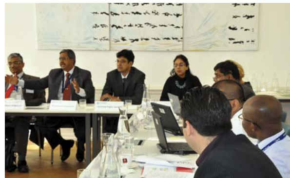
The first round of expert workshops, September 2012

The project is aimed at promoting states' implementation of Article 9 of the UN Convention against Corruption (UNCAC), supporting private actors' efforts to comply with the 10th Principle of the UN Global Compact, and reducing vulnerabilities to corruption in the public procurement system.