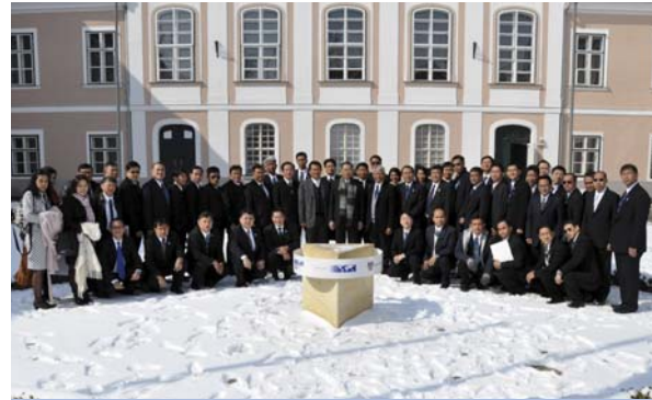
Group picture of anti-corruption experts from the NACC

The training was complemented by visits to the United Nations Office in Vienna, the Organization for Security and Co-operation in Europe, and the Austrian Federal Bureau of Anti-Corruption.