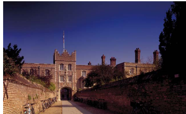
Symposium venue - Jesus College, University of Cambridge