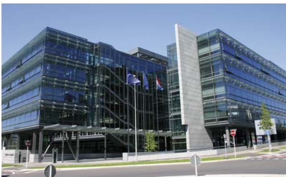
Symposium venue – Chamber of Commerce, Luxembourg

On 5 June, the Minister of Justice of Luxembourg, H.E. Octavie Modert, the Enterprise Europe Network, Luxembourg's Chamber of Commerce, and IACA are organizing a symposium on the issue of "Public-Private Cooperation in the Fight against Corruption". The event intends to draw participation from governments, international organizations, EU bodies, and private businesses.